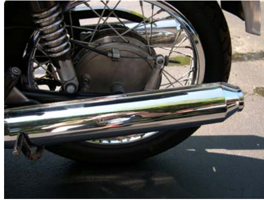
19 Rear brake and muffler