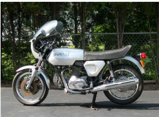
4 Left side

It starts with one or two kicks and there are no adverse running noises. I've always used straight SAE 50 weight oil and changed it every fall. The seat could use a new covering skin (now at Bevel Heaven) and the wiring could stand a new fuse box with modern automotive fuses (which I'll include). The Italian bullet fuses made LUCAS systems look modern!