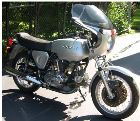
21 Alternate Right Side View