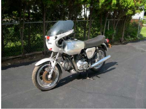
2 Left front view