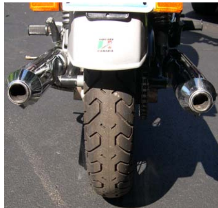
17 Rear Tread