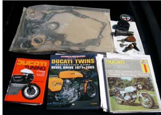
11 Workshop manual, keys & tools