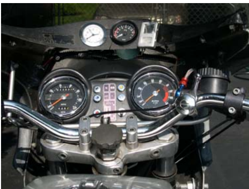
10 Whole cock pit view