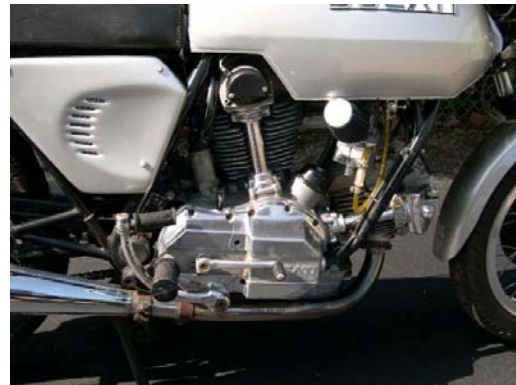
5 Right Side