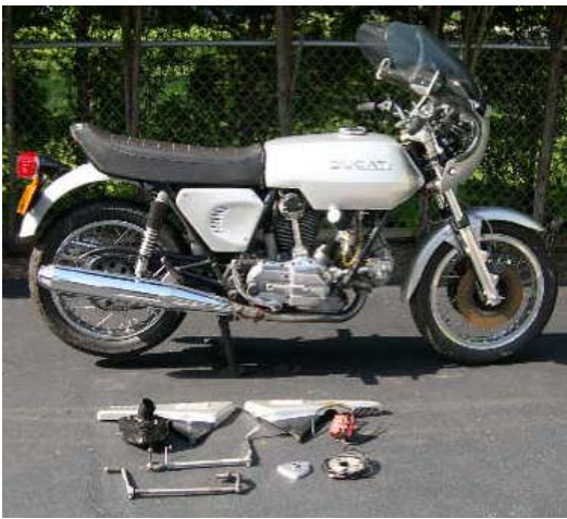
20 Right Side View