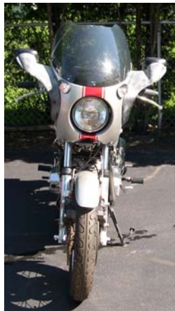
16 Front View and tread