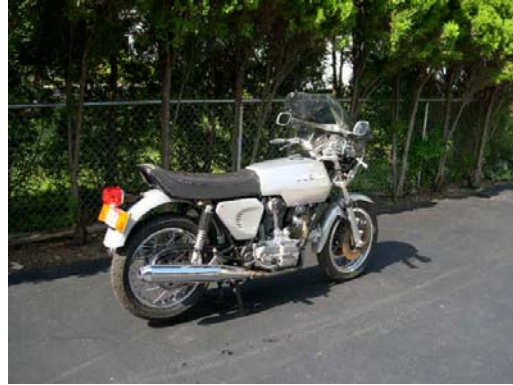
3 Right Rear

There is a clear Illinois title. This bevel head, non-desmo, Ducati has been continually insured and licensed by me since 1990. I have no idea of how many miles are on the engine. In twenty years, I have probably put less than 10,000 miles on it. The speedometer is not the original. When I took possession back in 1990, it had the wrong head light and mounts, a Honda 750 speedometer and tachometer, no turn signals, no handle bar switches, but dual front brakes and most importantly this engine has never leaked. I expect it had been dropped before I got it and that's why the handle bar controls, front lighting and turn signals were missing, and the tank has had a dent fixed. The photos show that both the right side case and muffler have slightly thinner sections from a scuffle with the road.