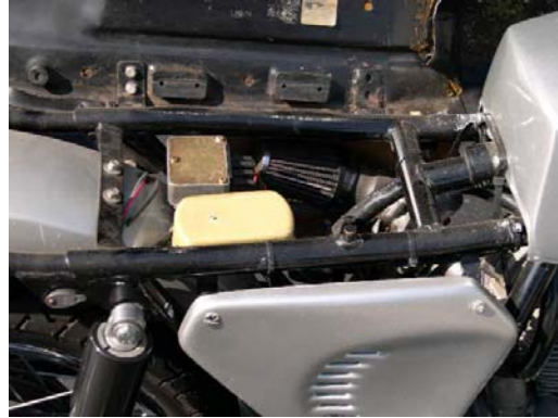
13 Fuse box and new voltage regulator