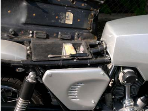
12 Tool tray & new side cover