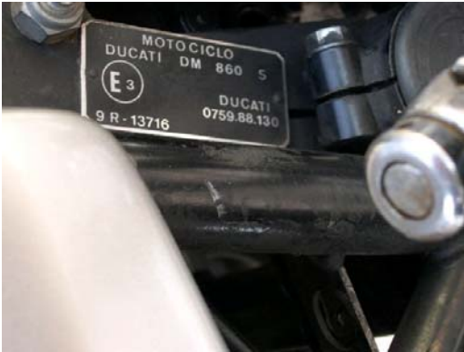
6 FRAME NUMBER