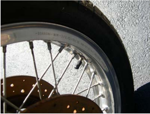
18 Borrani Front Rim & dual disks