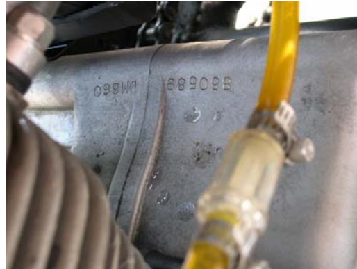
7 ENGINE NUMBER