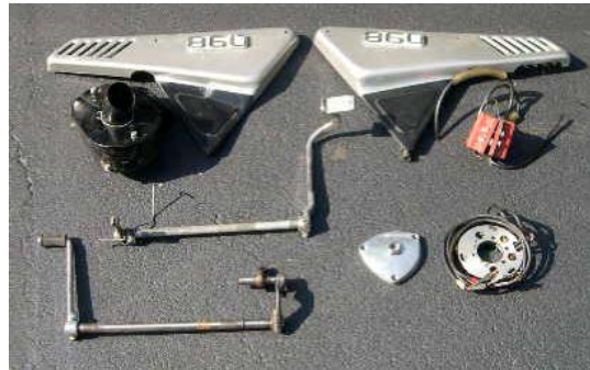
15 Left shift, Right Brake, rear filter & old ignition stator and cam cover