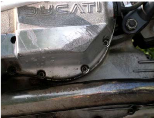
8 Scrape on right case and muffler